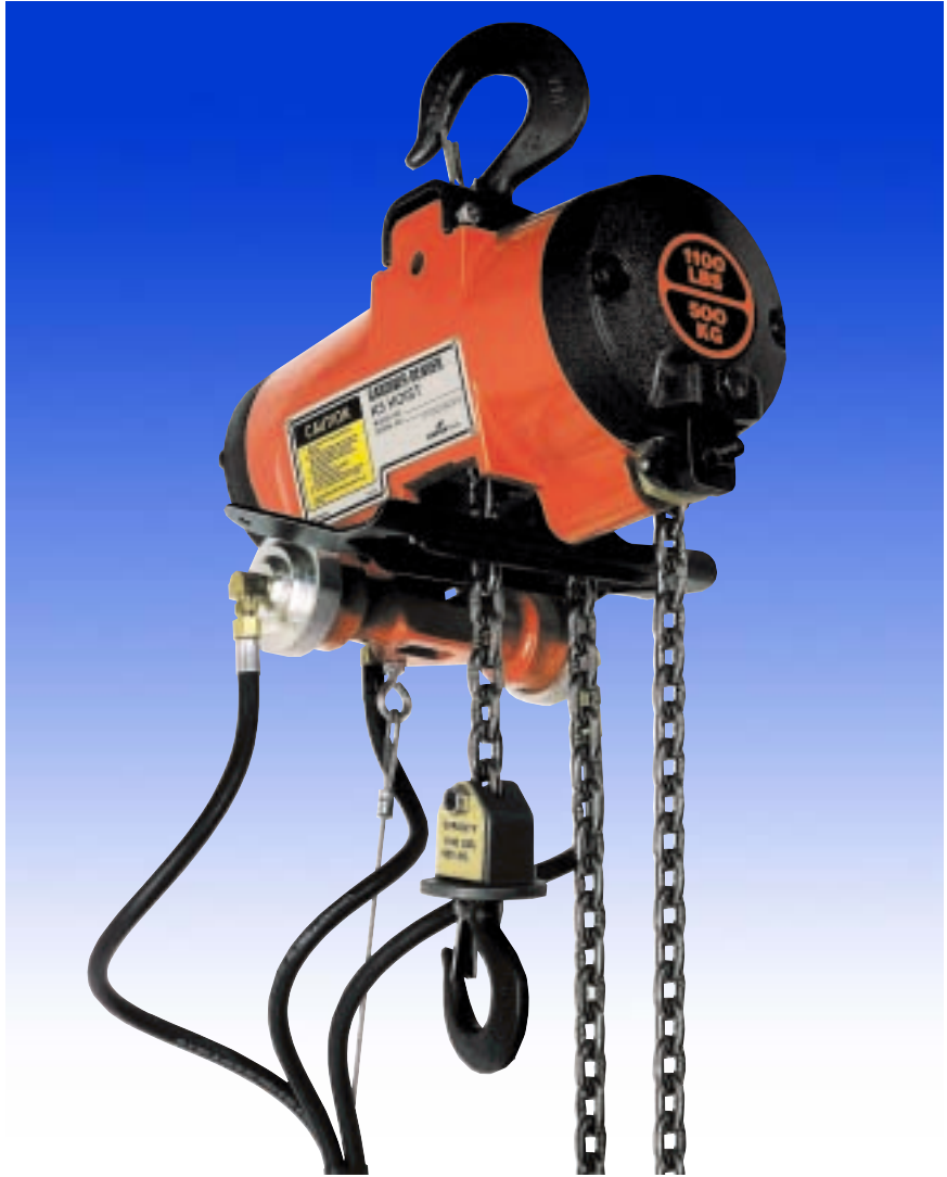
Single Reeved 550 lbs. (250 kg) & 1100 lbs. (500 kg) Capacity