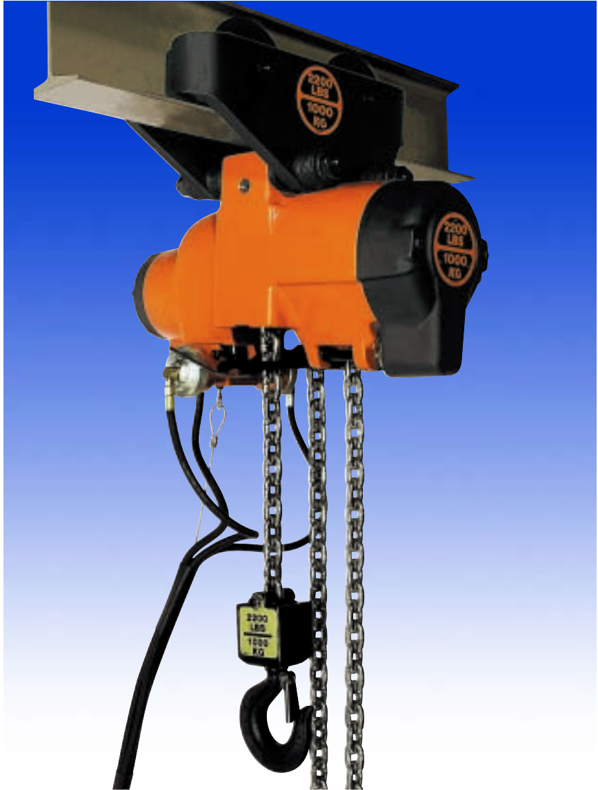
Single Reeved 2200 lbs. (1000 kg), 3300 lbs. (1500 kg) & 4400 lbs. (2000 kg) Capacity