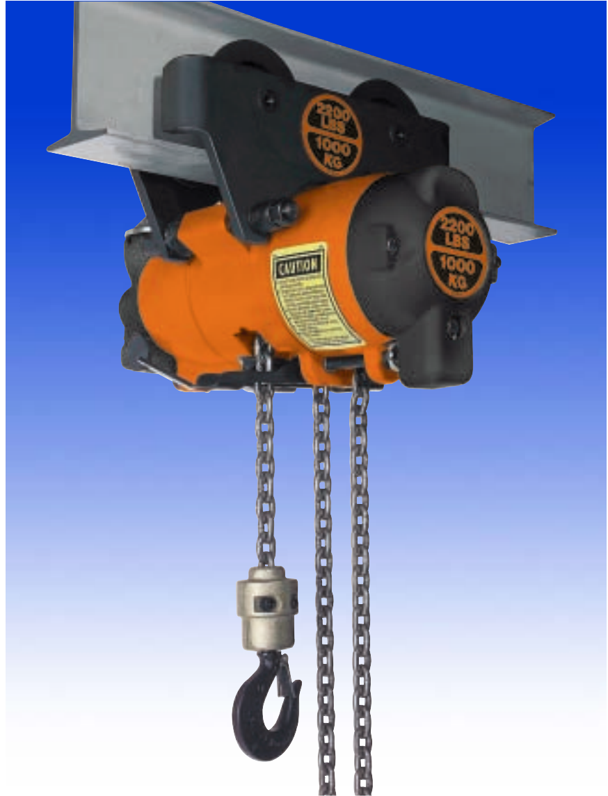
Single Reeved 1100 lbs. (500 kg), 1500 lbs. (680 kg) & 2200 lbs. (1000 kg) Capacity