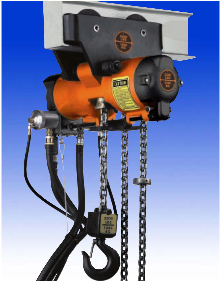
Single Reeved 2200 lbs. (1000 kg) & 4300 lbs. (1950 kg) Capacity