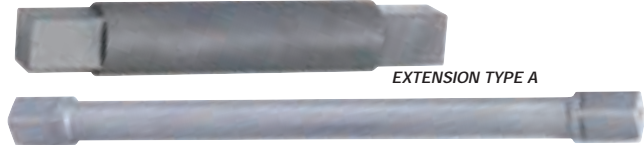
EXTENSION TYPE A