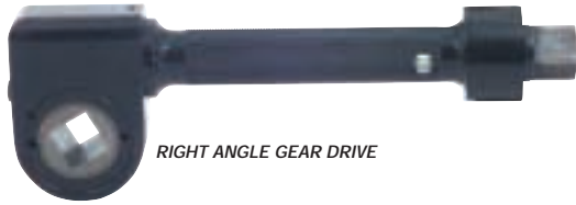
RIGHT ANGLE GEAR DRIVE

Precision gear drives provide the means to expand tubes in close, hard-to-reach places.