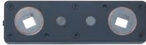
PARALLEL GEAR DRIVE