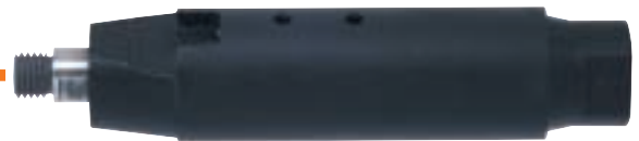
3000 SERIES MOTOR WITH OPTIONAL HEADS

Complete cleaner consists of: air motor with extra set of blades; choice of cutter head with two extra sets of cutters and cutter pins; universal joint with two extra pins; two drills.