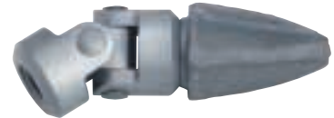
Drill Head with Universal Joint Range: 1/2 in. (12.7 mm) - 1-3/8 in. (34.9 mm) Deposit: heavy-medium to soft

If expanding blade head is ordered, one extra set of blades is furnished. For operating hose (not included) refer to page 99.