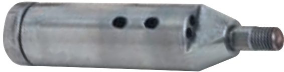
MIDGET MOTOR WITH OPTIONAL HEADS

Complete series of motors and heads available for tube sizes 1/2" to 1-3/8" (12.7 to 34.9 mm) I.D.