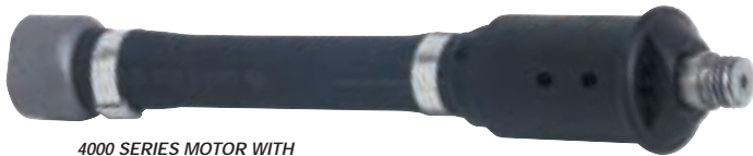
4000 SERIES MOTOR WITH OPTIONAL HEADS

Complete series of motors and heads available for tube sizes 1-1/2" to 13-1/4" (57.1 to 336.5 mm) I.D.