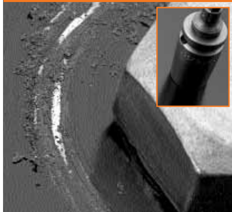
Standard socket – Heavy Damage