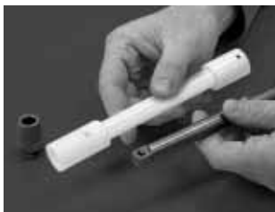
Female Drive End Assembly

*For best results, Apex recommends using our optional installation tool for installing the retaining ring. See page 70.