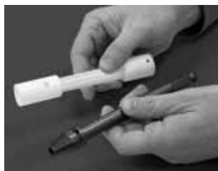
Male Drive End Assembly*

Apex FreeSpin covers can be installed in seconds. No special trips to the tool crib are required.